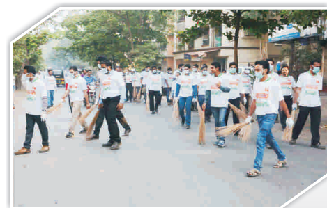
Participation of Staff & Students

"Swachh Bharat Abhiyan" is a national campaign officially launched on 2nd October 2014 at Rajghat, New Delhi, by our Hon'ble Prime Minister, Mr. Narendra Modi.