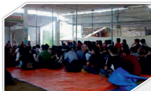
Yusuf Meher Ali Center