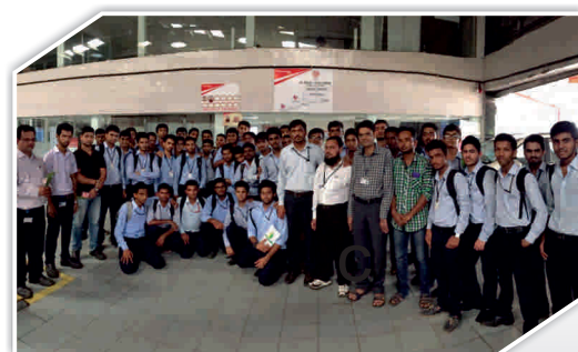
MAHINDRA & MAHINDRA