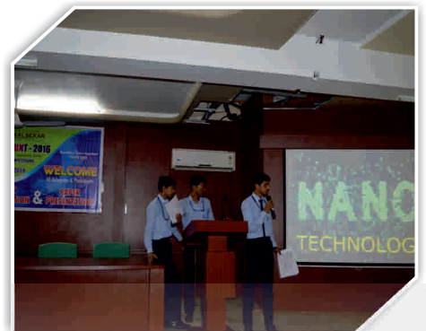
Paper Presentation - Nano Technology