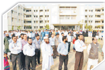
Management, Staff & Students of AIARKP & AIKTC gathered to honour Our Flag-Our Pride