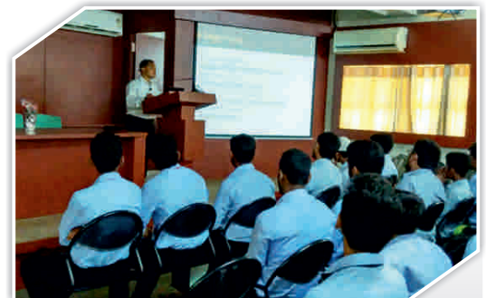
Expert Talk Conducted By MTNL