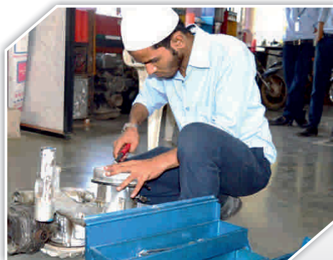
Techno Huntz - Todo Jodo