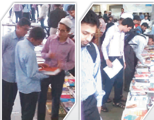
Students browsing through books available at a discounted rate