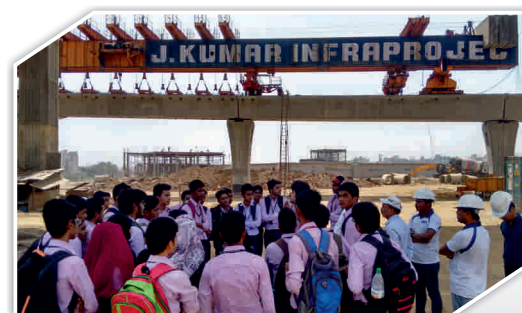
Metro Railway Bridge, Taloje.