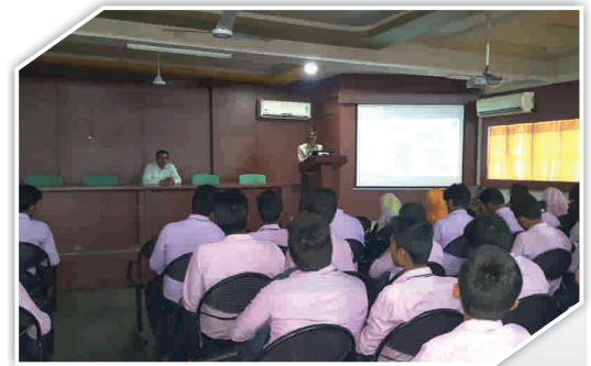
Advanced Surveying Instruments