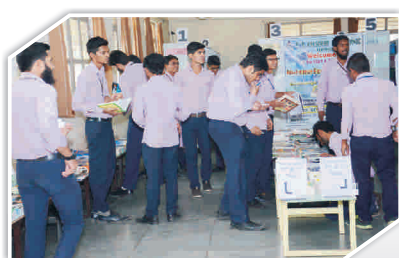
Books covering a wide range of subjects