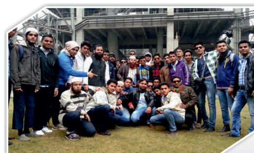
Cement Manufacturing Plant, Chandigarh