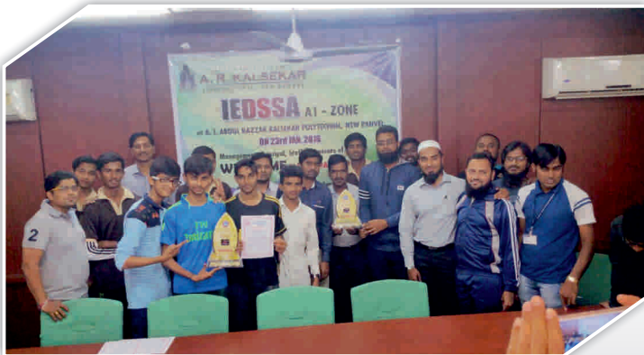
Zonal IDESSA Sport Winner Team

Runner up in Volleyball @ Karnala Sports Academy (District Level)