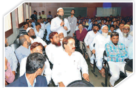
Active interaction between Parents and Management.