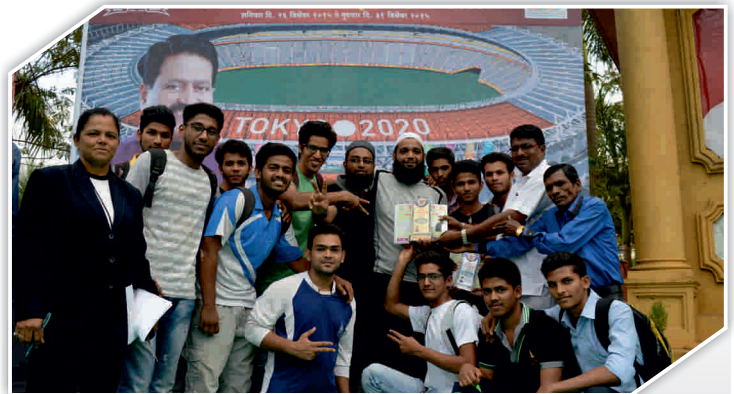
Volleyball Winner Team @ Karnala Sports Academy