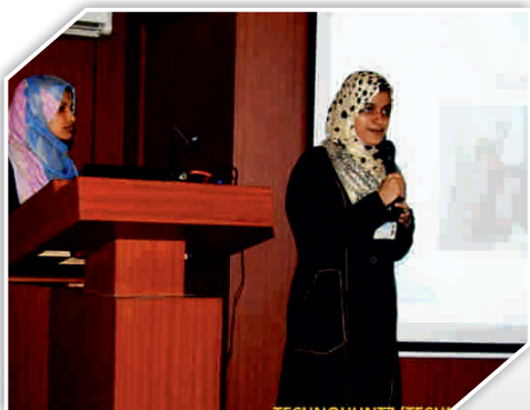
Techno Huntz - Technical Paper Presentation